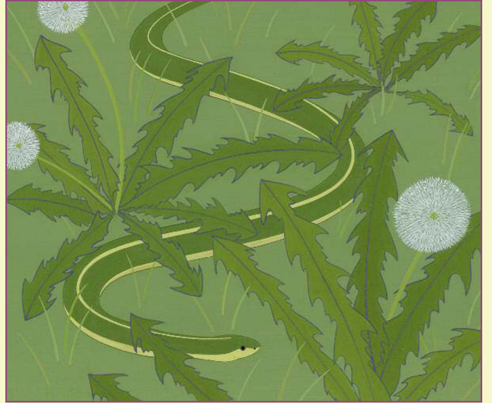
sliding through weeds. y deslizándose entre hierbas.