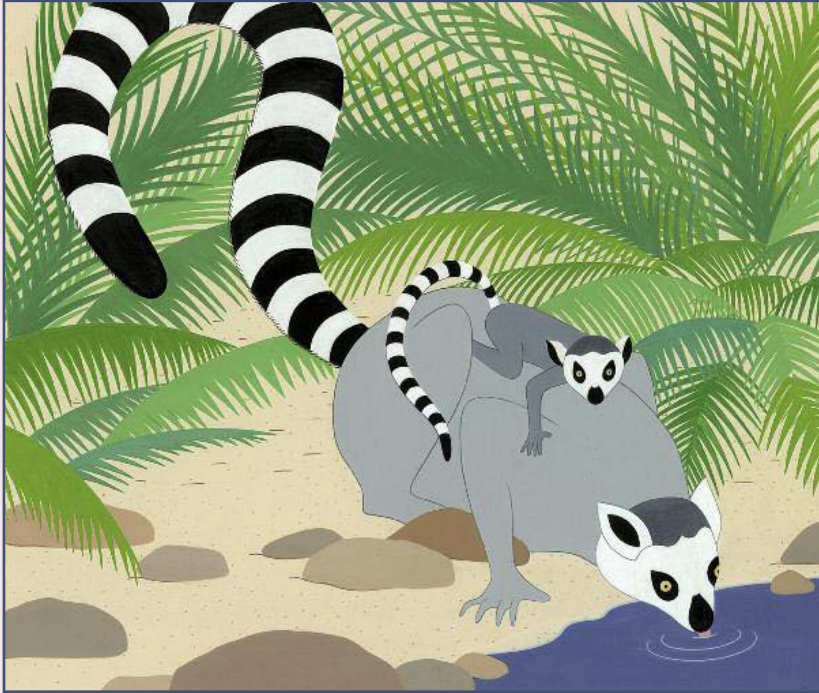
Drinking from rivers, Bebiendo de los ríos