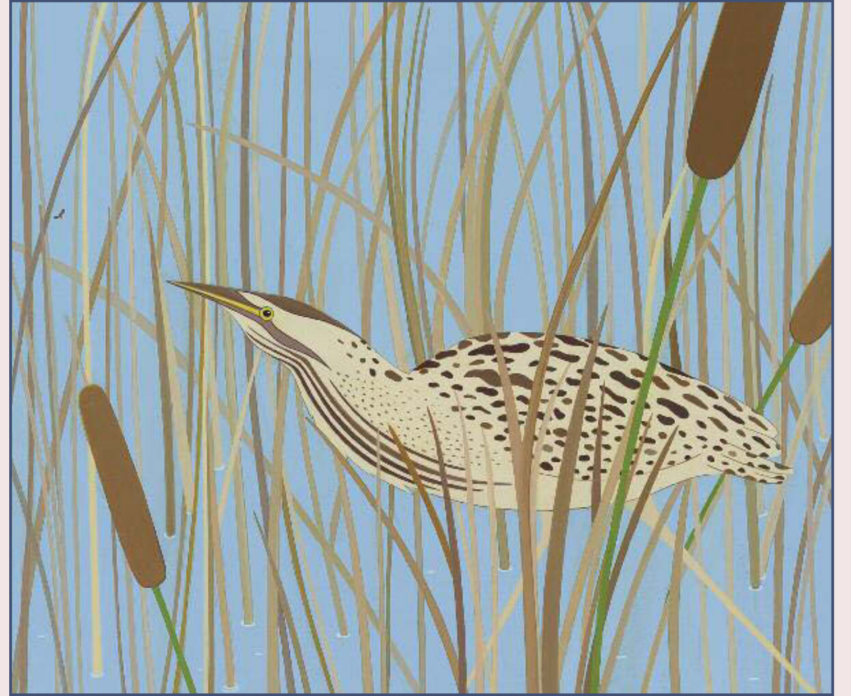
and darting through reeds. y atravesando los juncos.