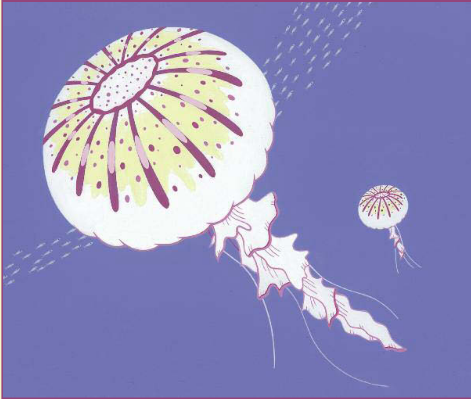
Stripes found in water, Hay rayas en el agua,