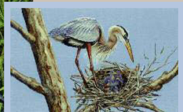
Great blue heron adult and chicks