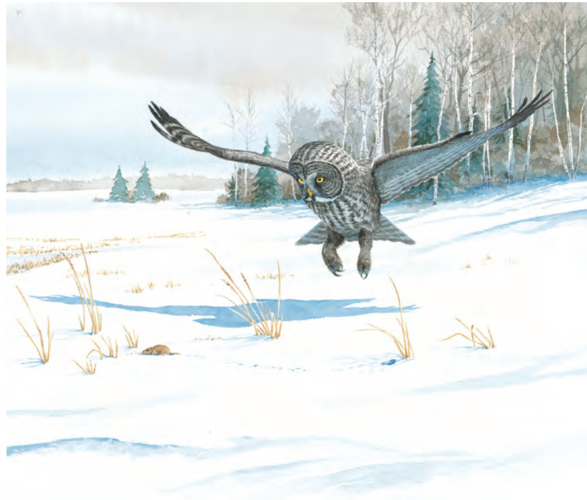
PLATE 1 Great Gray Owl (also shown: Meadow Vole)

Raptors are birds of prey that hunt and eat other animals.