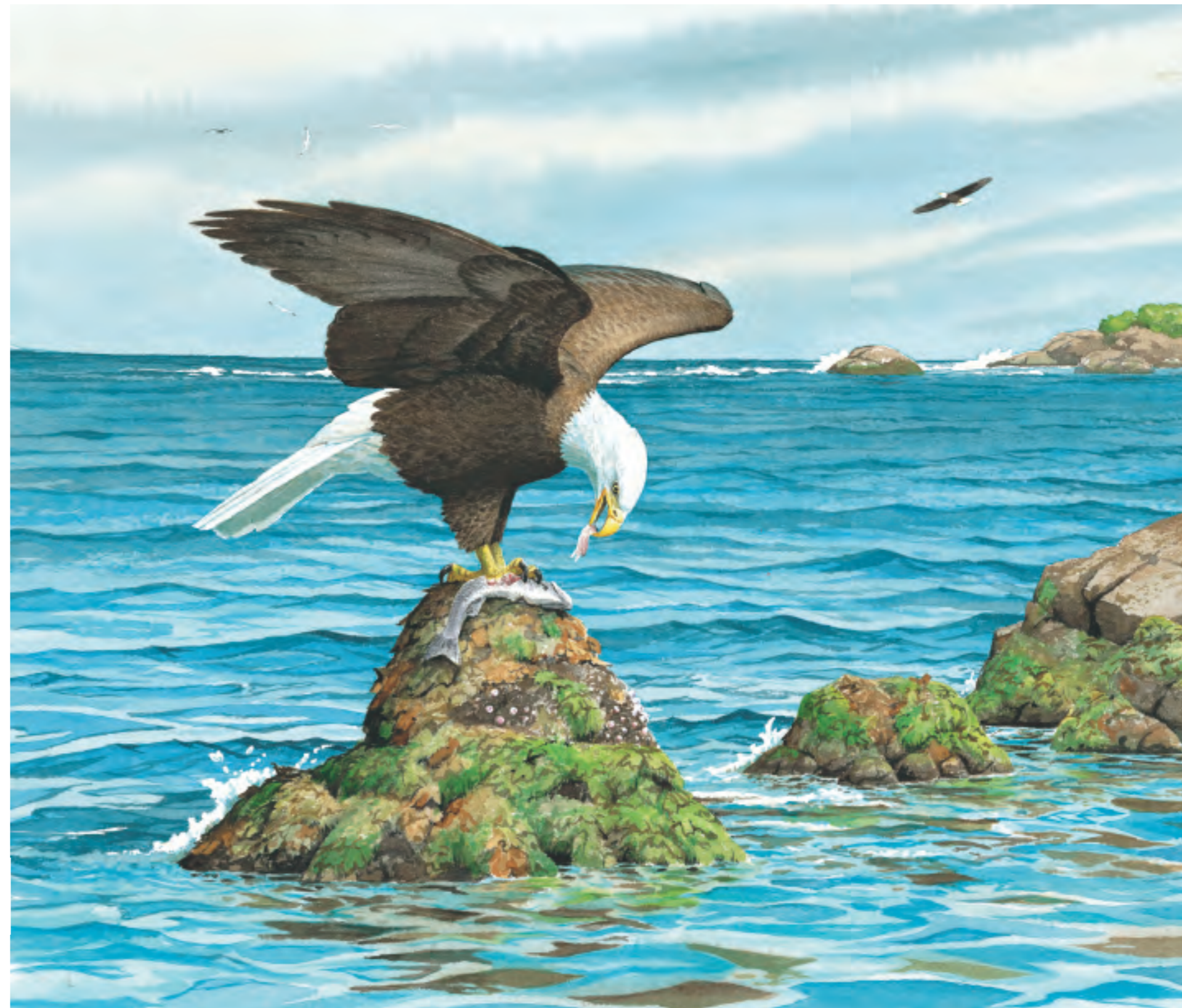
PLATE 2 Bald Eagle

They have hooked beaks for tearing meat into bite-sized pieces.