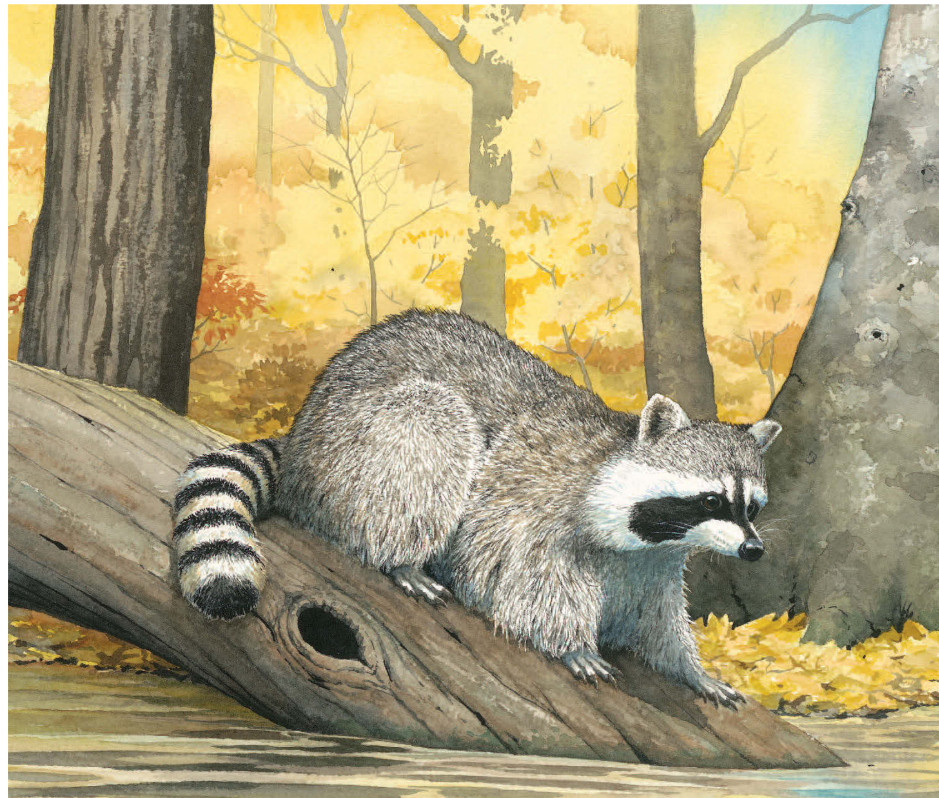
PLATE 1 / LÁMINA 1 Northern Raccoon / mapache