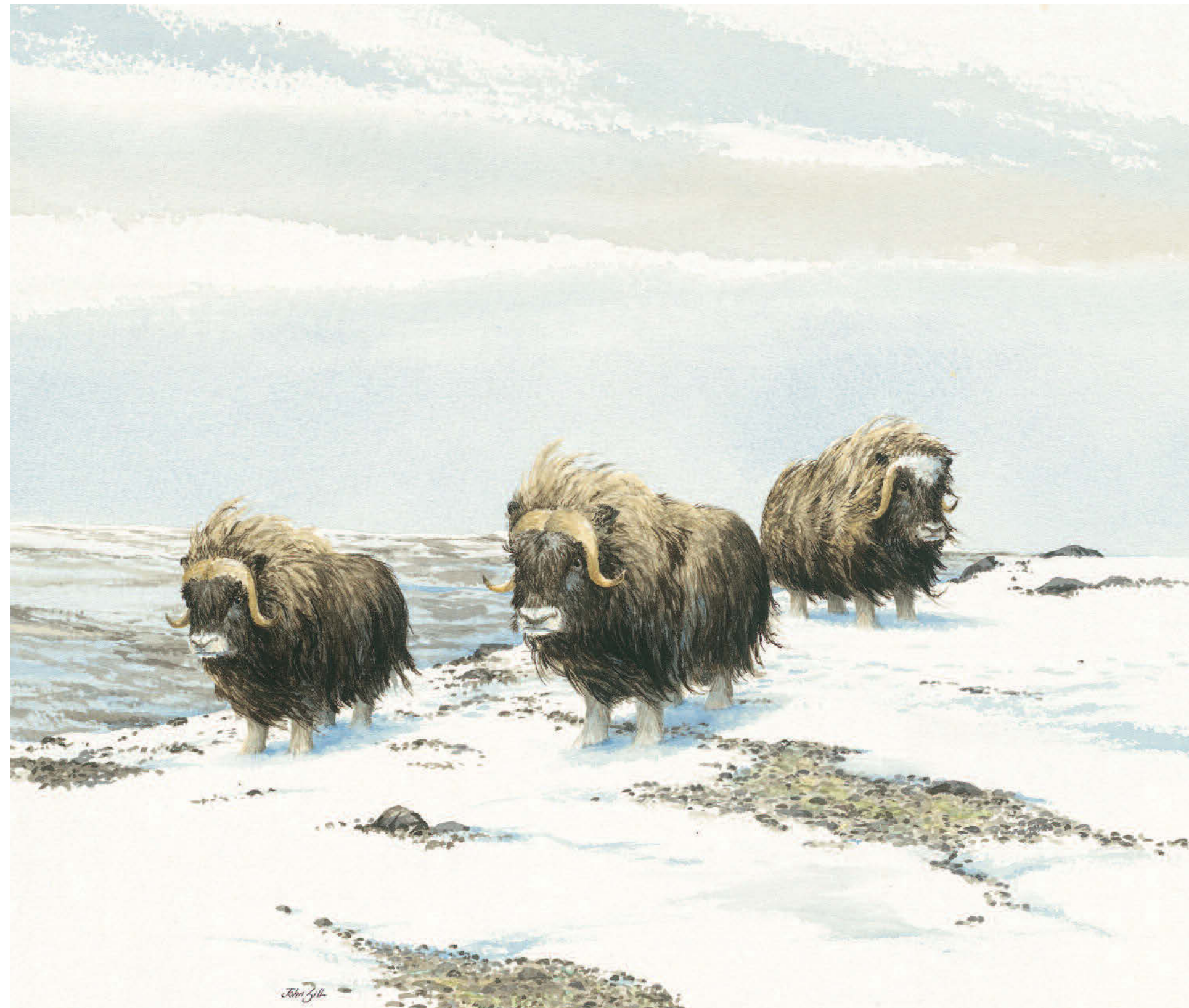
PLATE 2 / LÁMINA 2 Muskox / buey almizclero

They may have thick fur, Pueden tener un pelaje denso,