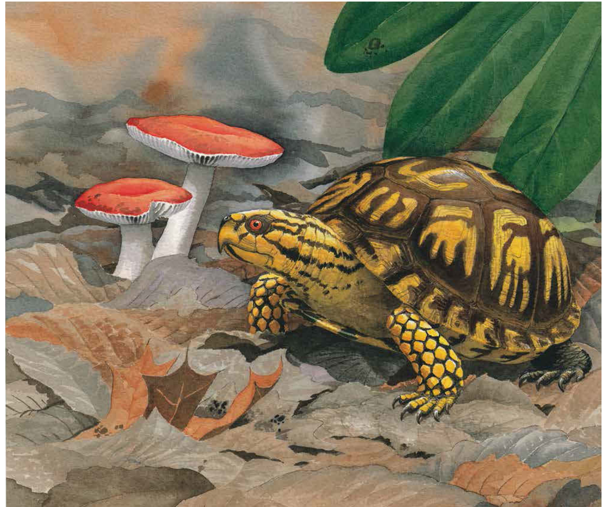
PLATE 2 Eastern Box Turtle