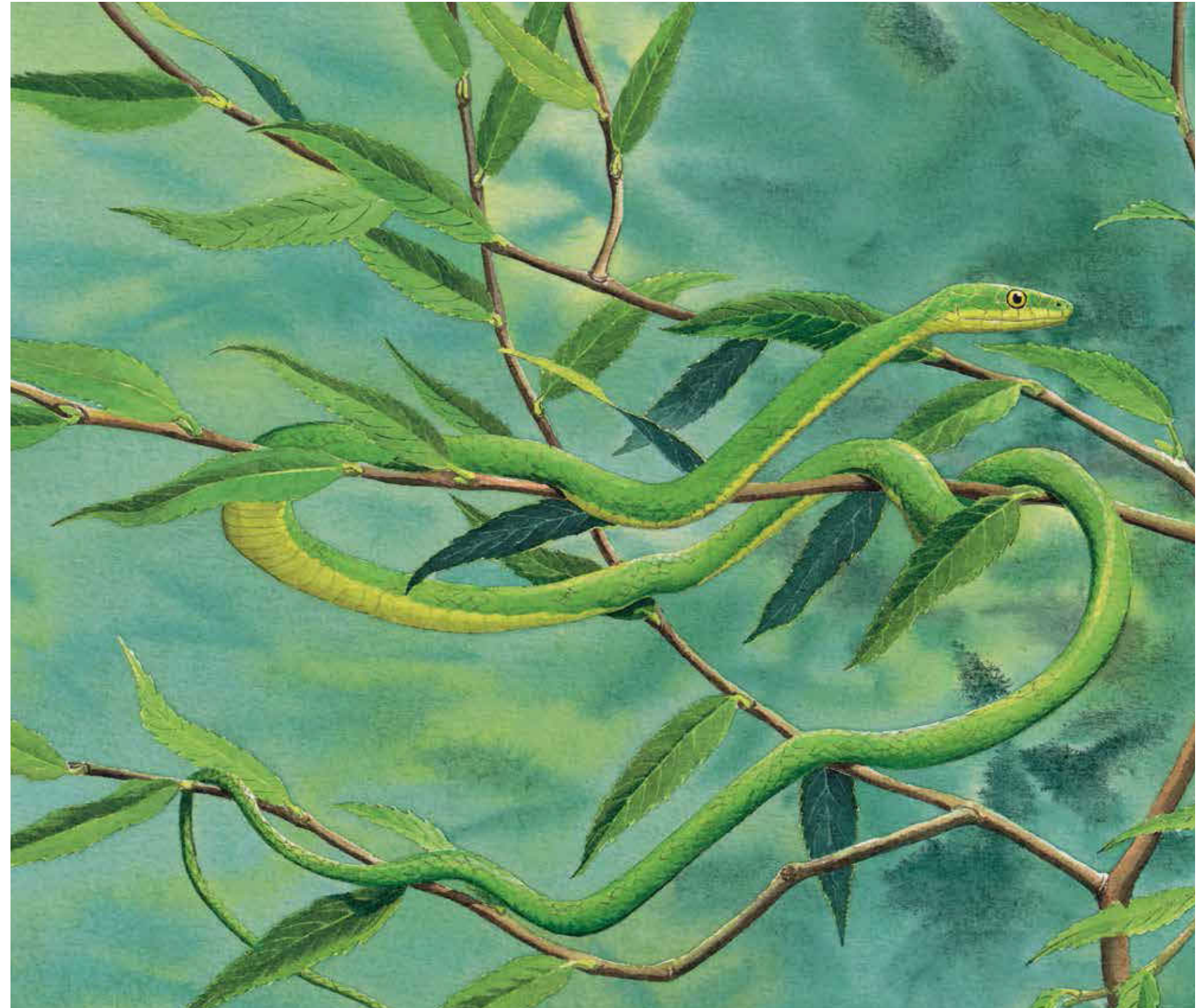
PLATE I Rough Green Snake