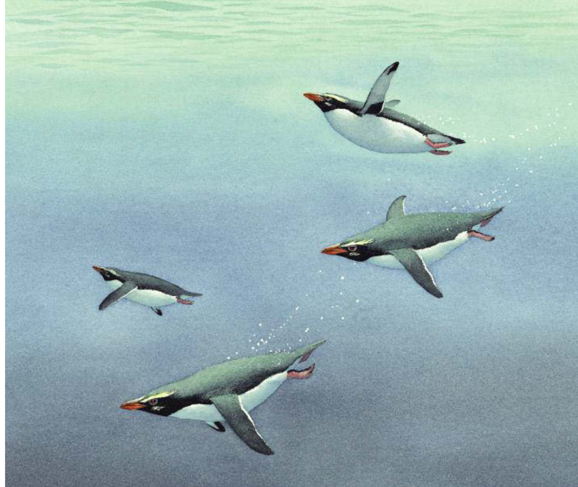
PLATE 2 Fiordland Penguin

They swim very well by using their wings as flippers.