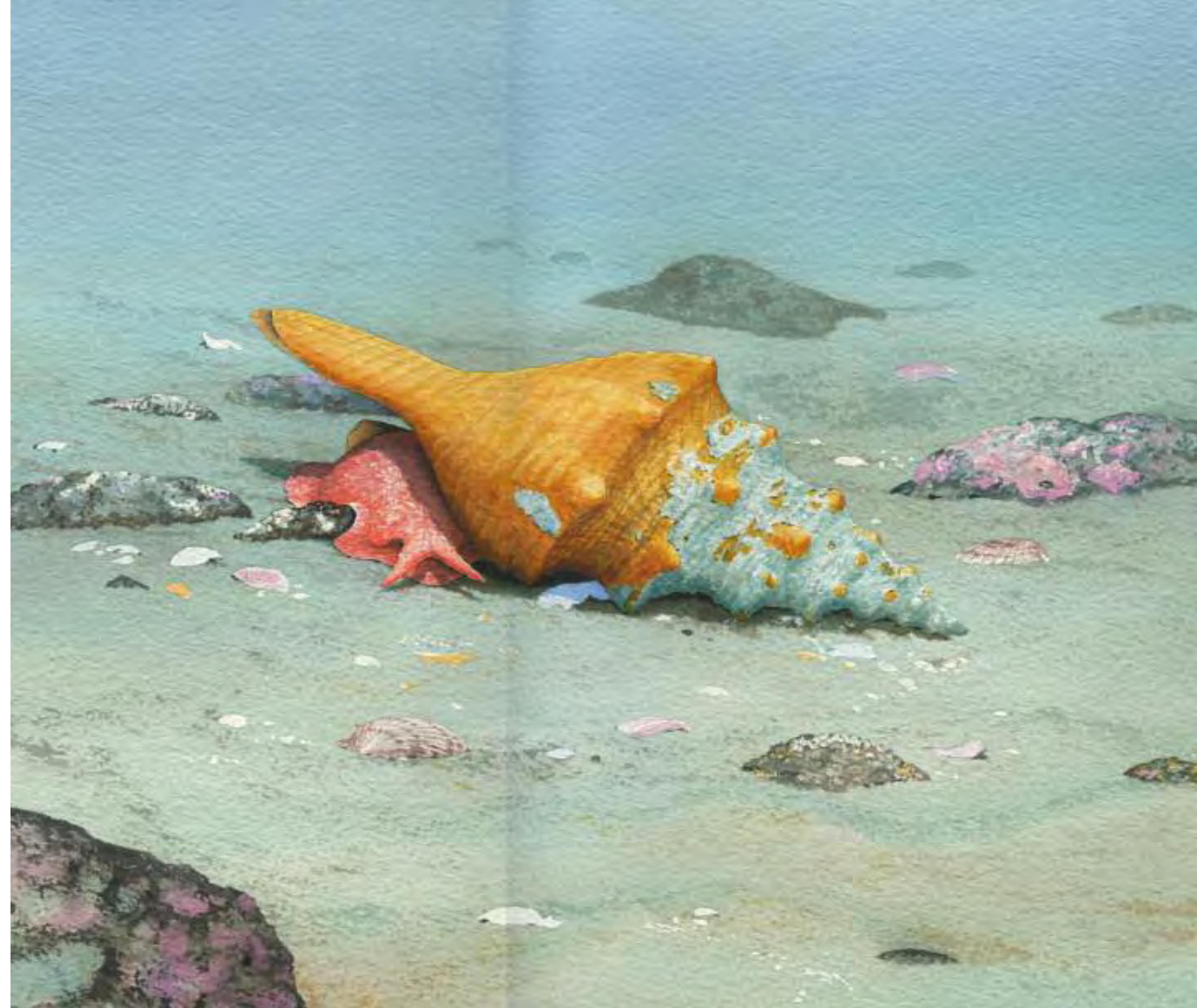
PLATE 2 Horse Conch

Most mollusks have hard shells that protect their soft bodies.