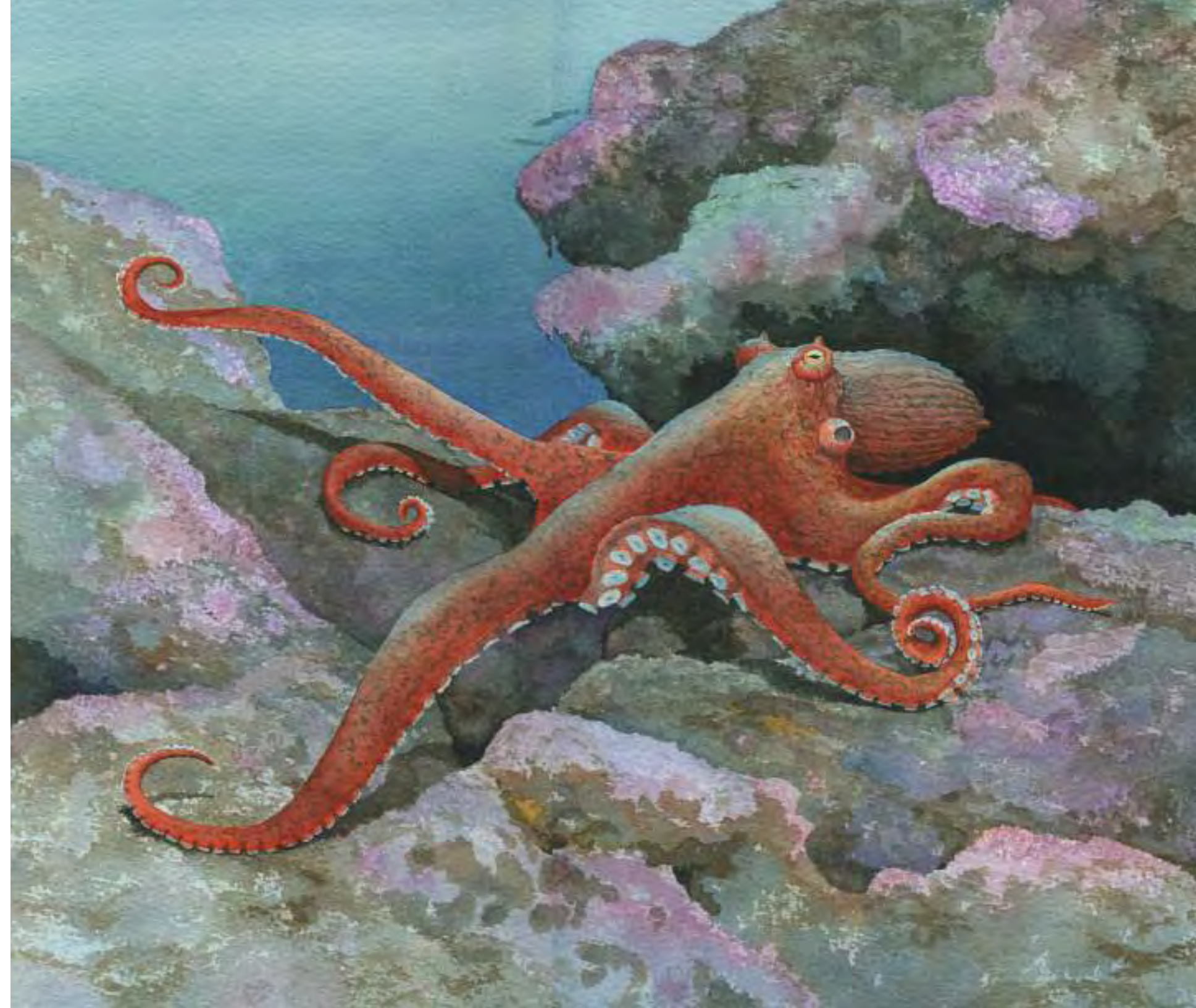
PLATE 1 Giant Pacific Octopus

Mollusks have soft, moist bodies with no bones.