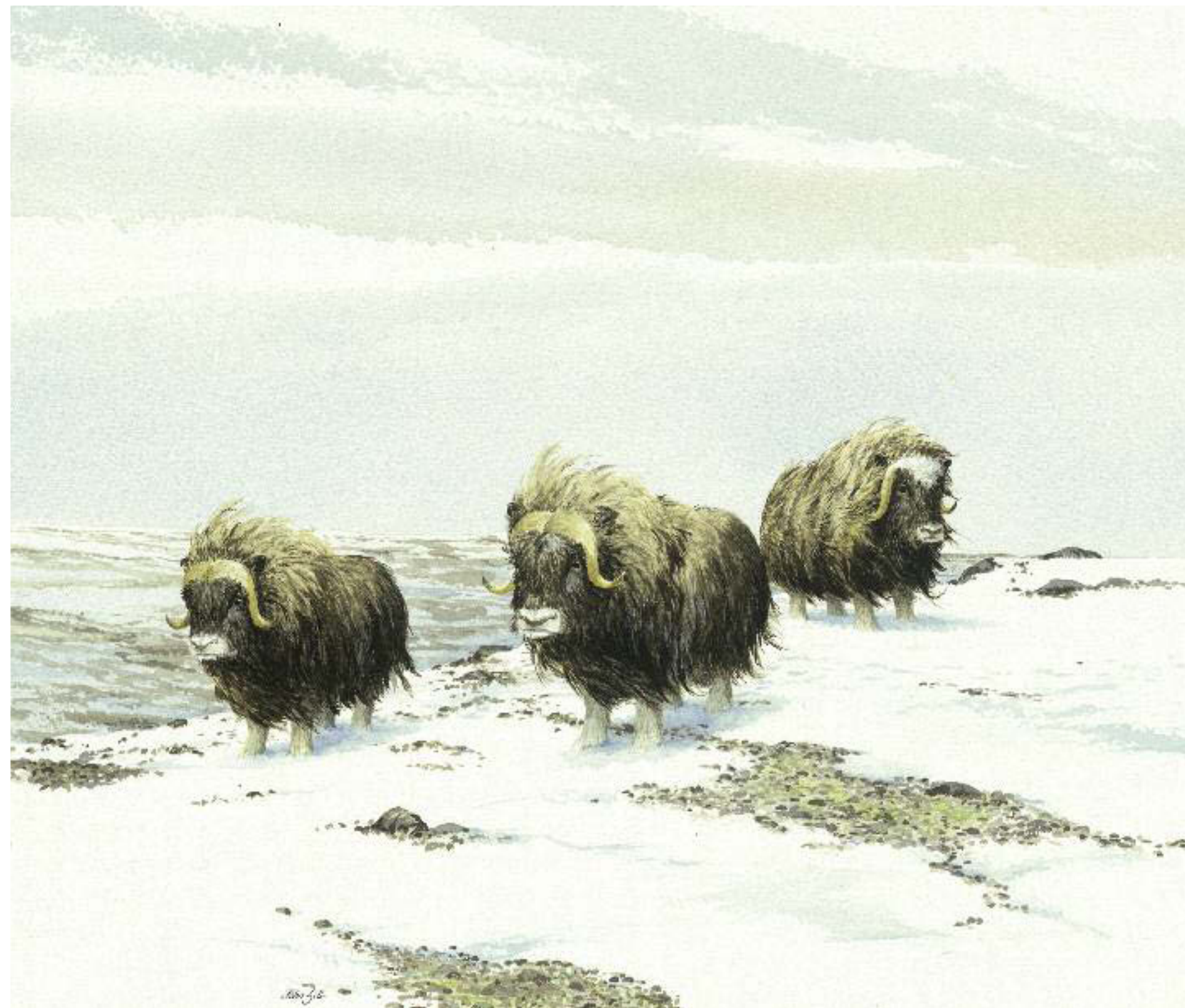
PLATE 2 Muskox