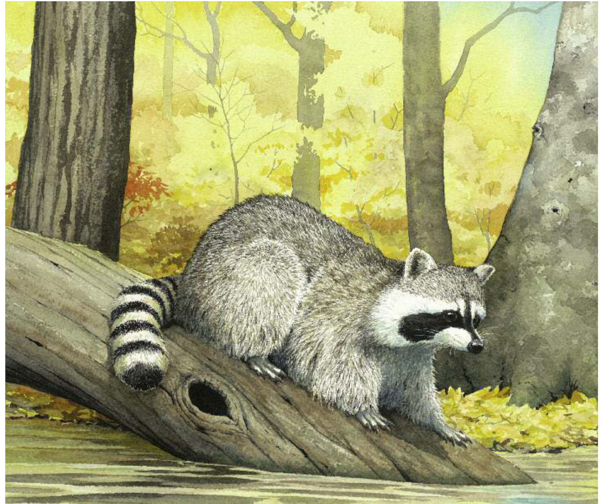
PLATE I Northern Raccoon